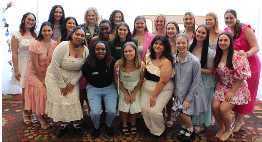
Collegiate Management Team and Directors